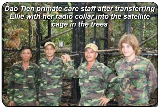
Dao Tien primate care staff after transferring Ellie with her radio collar into the satellite cage in the trees

Thanks for all your support – we could not do it without you.